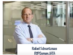
Rafael Schwartzman RIP Europe, IATA