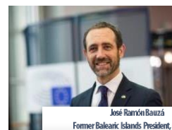
José Ramón Bauzá Former Balearic Islands President, MEP, TRAN Coordinator, Tourism Task Force Chair